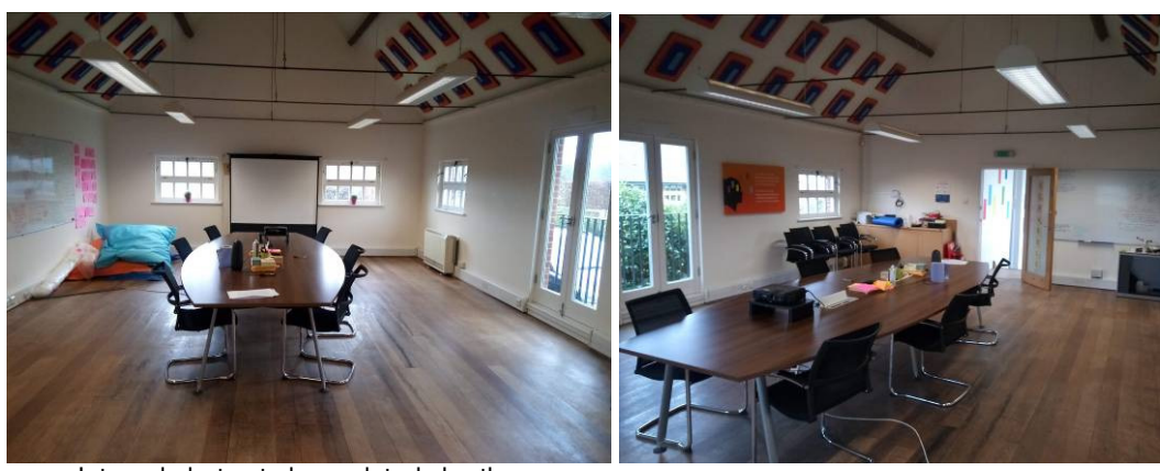
Internal photos to be updated shortly.